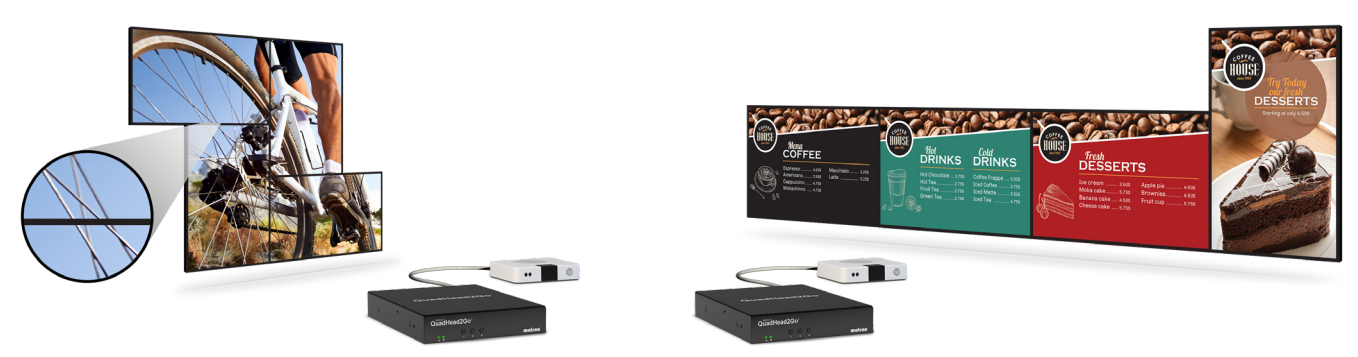
Fine-tune bezels for seamless image displays