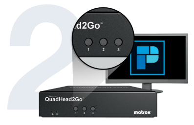
Configure using on-device buttons or the Matrox PowerWall software