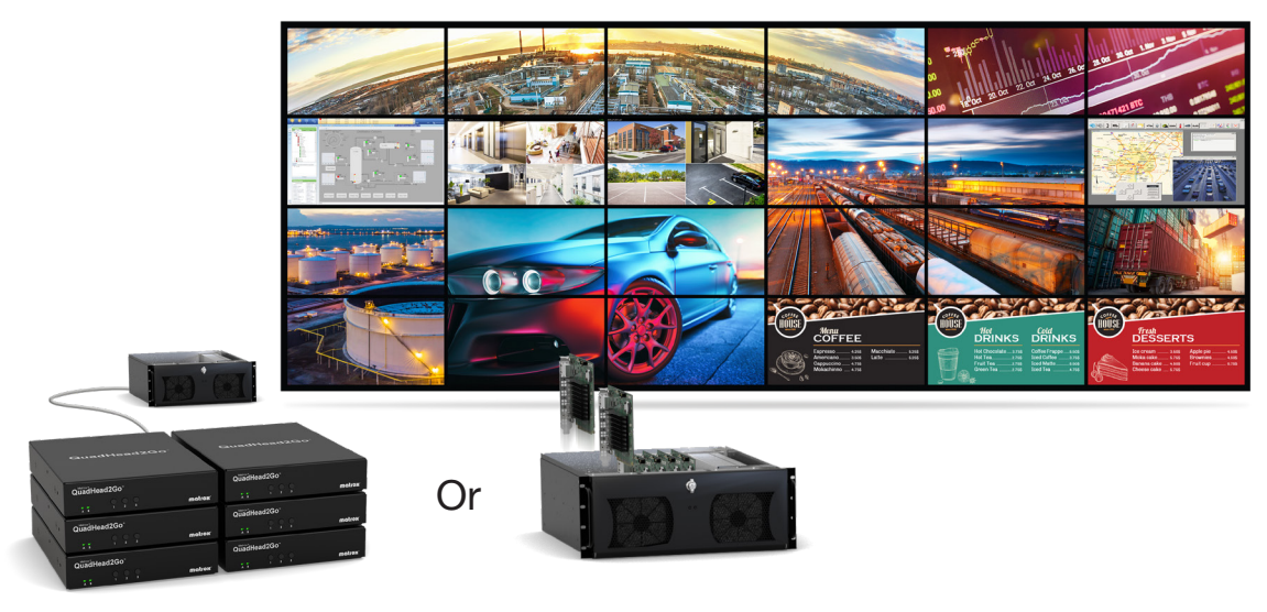
Use multiple QuadHead2Go units (appliances or cards) to easily create and/or expand large-scale video wall solutions