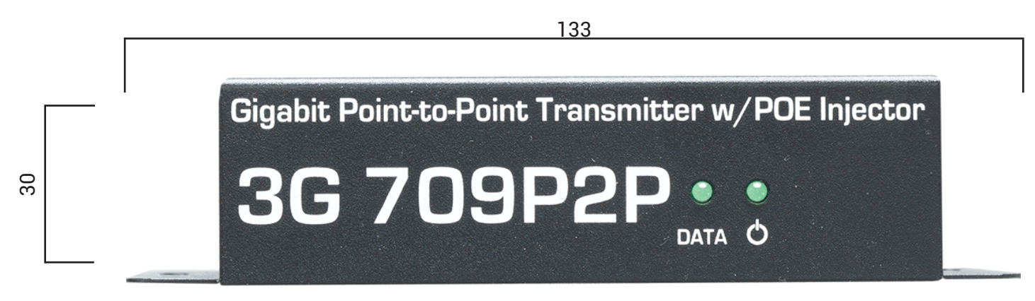
All measurements in millimeters (mm)