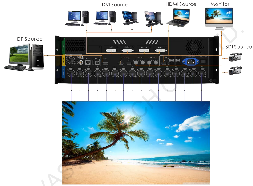
LED Screen 4K×2K