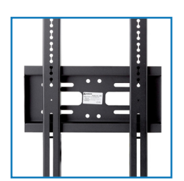
Portrait installation of the screen