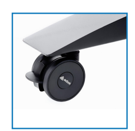
4 braked castors